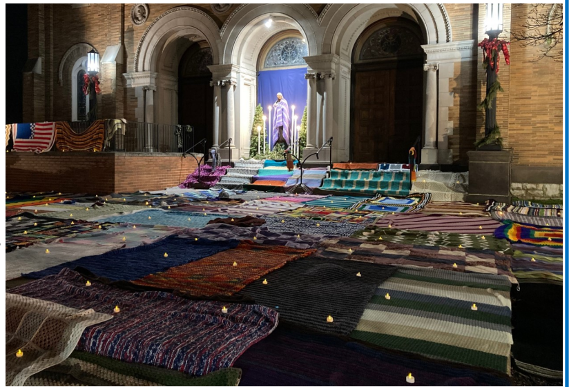
The “blanket of blankets” displayed on our High Street Plaza. The blankets (all hand-made by community volunteers) were blessed during the event and distributed to those in need.

Thank you so much for your hospitality in hosting the blanket event on December 21. The event was a huge success because of your willingness to host. We are so grateful for your faithfulness.