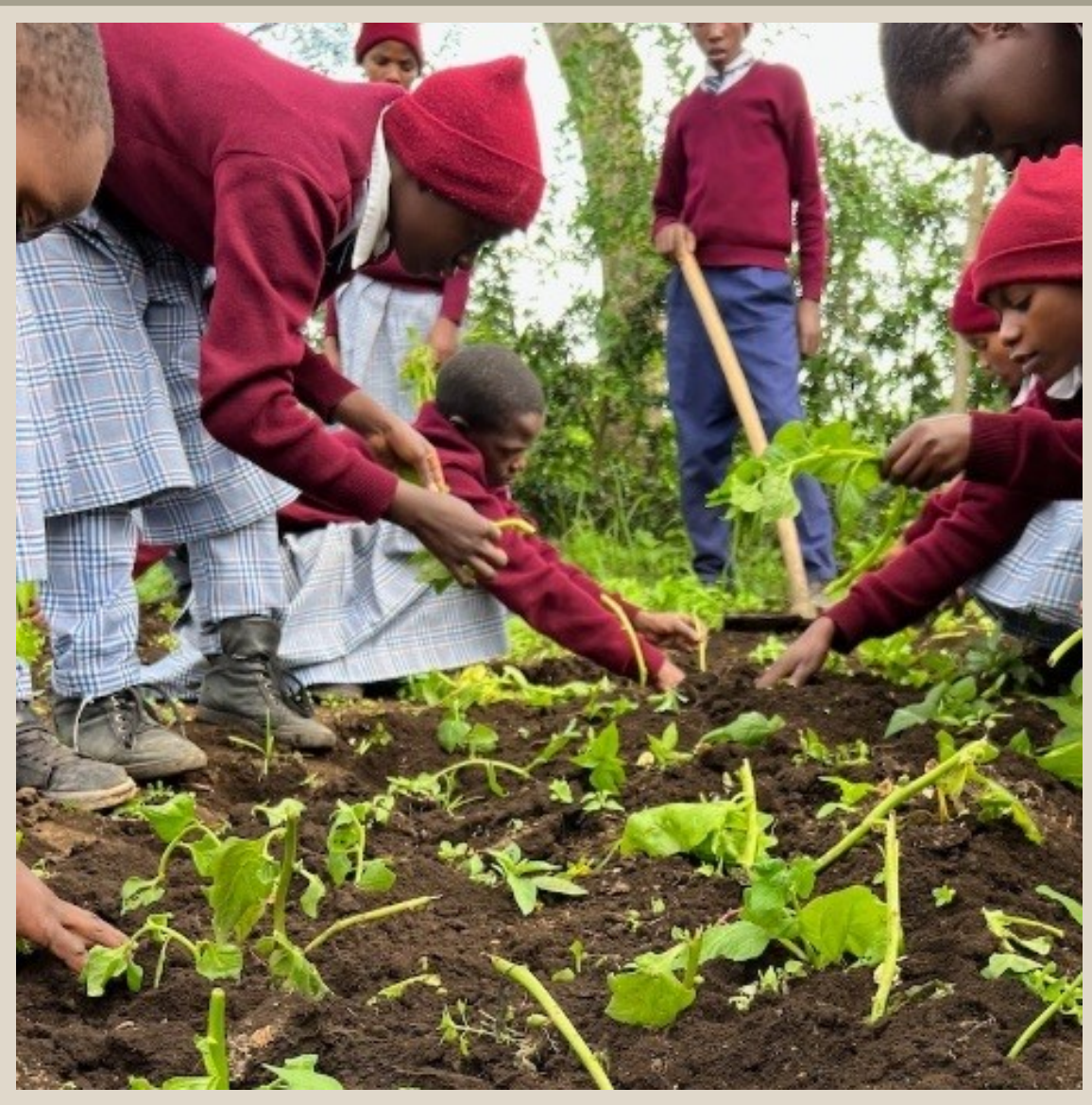
Planting a perennial spinach for the future!