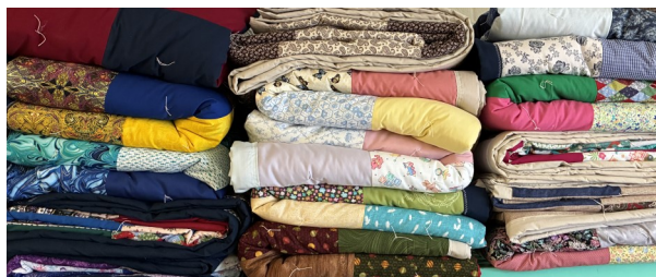
Some of the many quilts already made for LWR this year - thank you, quilters!

Fabric donations may be placed in the designated container in the hallway outside the church office. Thank you!