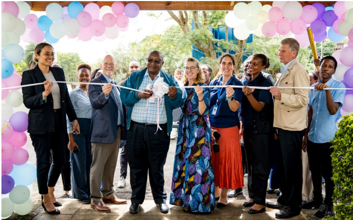
Below: Ribbon cutting at the Centre opening in April