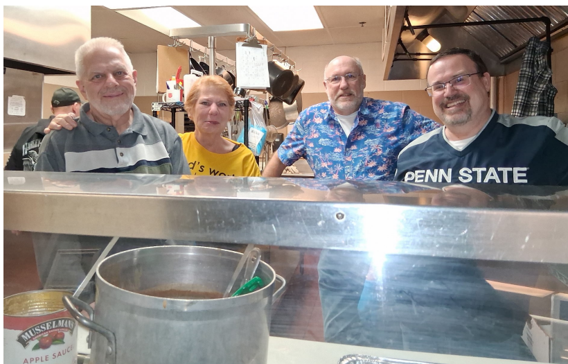
The April 2026 volunteer team

Prior to each serving date, the Social Ministry & World Outreach Committee advertises in our bulletins for donations of needed food items and volunteers to serve and clean up at My Brother's Table, 20 E. Pomfret Street.