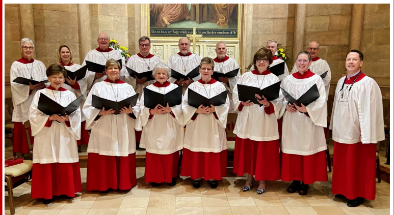
Easter Sunday 2023