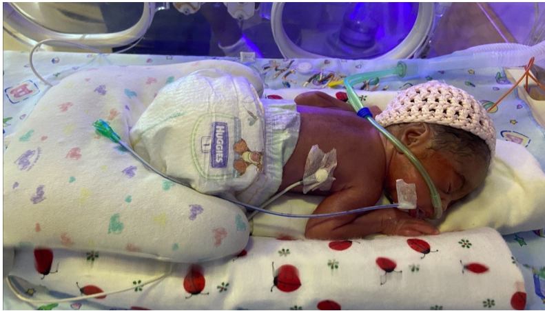
Pictured above: a NICU patient