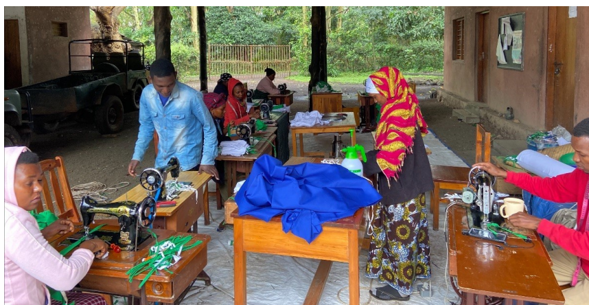
Tailors hard at work making cloth face masks for health care workers.