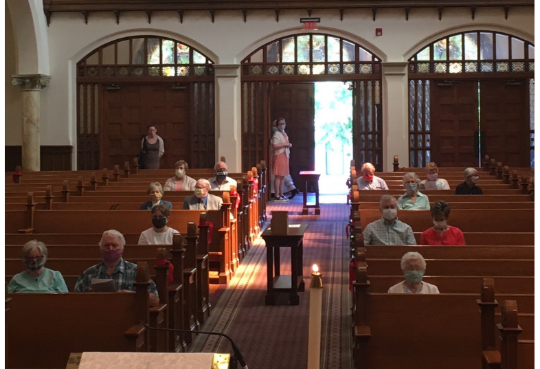
Ready for worship our first Sunday back, June 7!

Whether you are worshipping in our sanctuary or in your living room, we give thanks for you, our First Lutheran family!