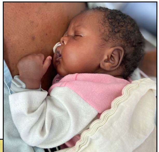
Pictured above: Sabina’s daughter at 60 days old.