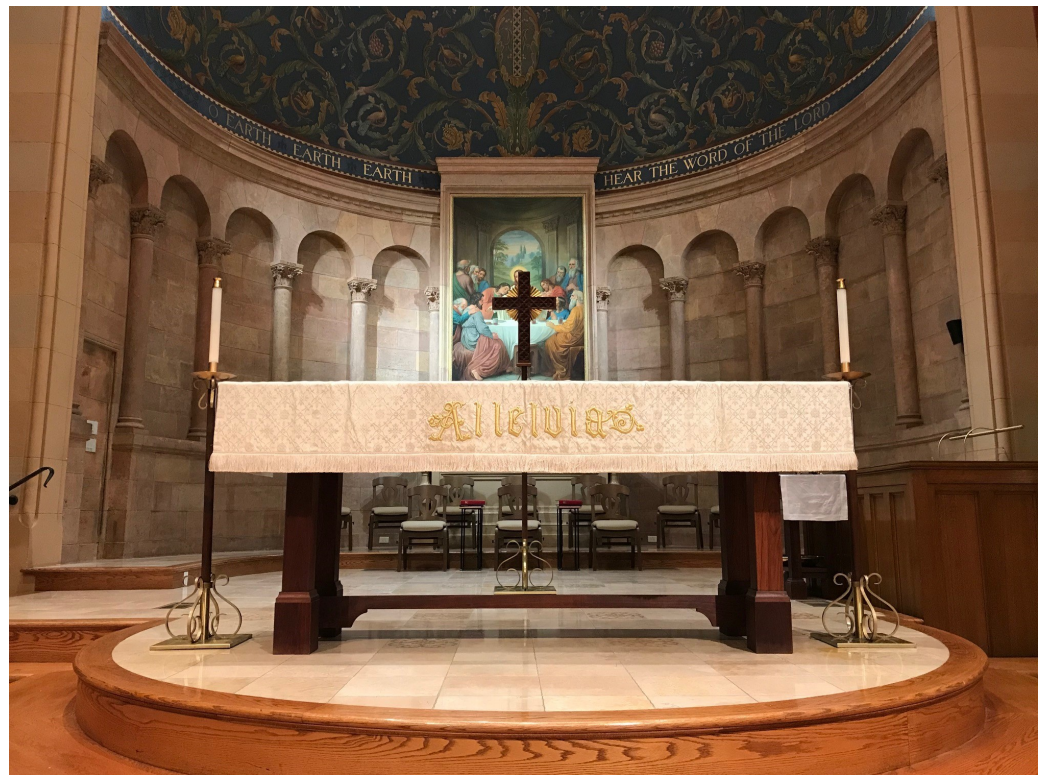
Easter Sunday The chancel put back together and decorated for Easter morning (just missing lilies this year!). Our 2020 Paschal candle lit for the first time!