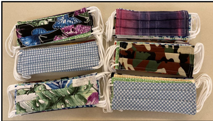
Above: Face masks for LWR