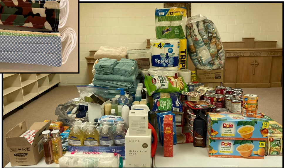
Above: Donations for Safe Harbour