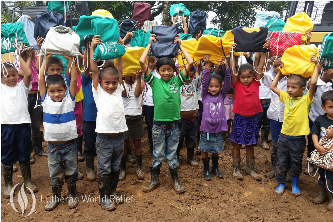
Students in Nicaragua hold up school kits they received in August 2015.

Please give generously on Ingathering Sunday, October 7, to help assure that LWR's work continues throughout the world. LWR envelopes will be available at worship; checks should be made payable to " First Lutheran Church " and designated for "LWR Quilt & Kit Shipping Fund."