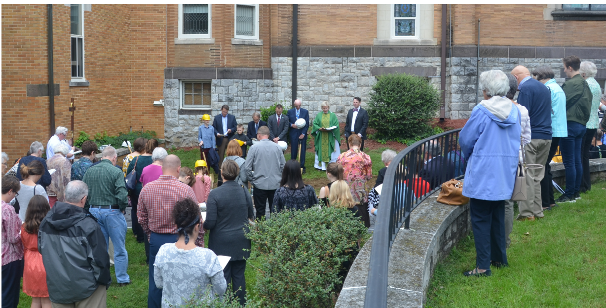
Groundbreaking on Sunday, September 23

Thank you for your cooperation and patience as we are "Building to Serve"!