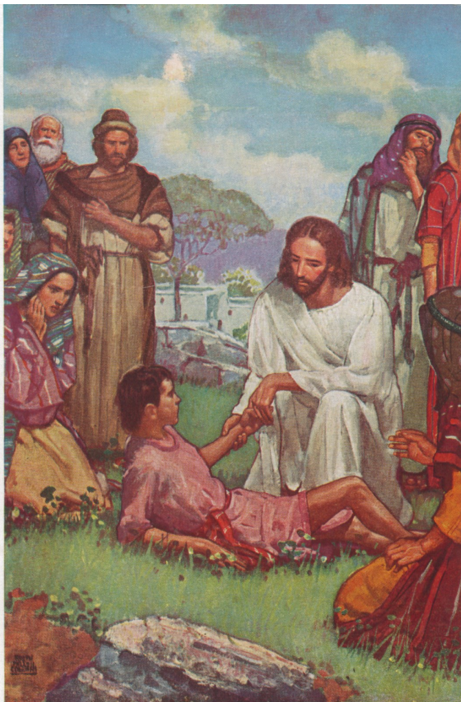
Kindergarten 2 • Winter Quarter