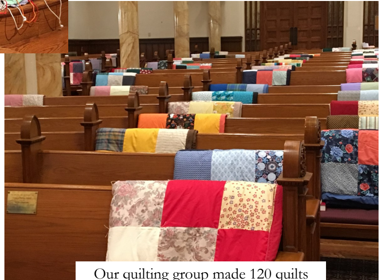
Our quilting group made 120 quilts for Lutheran World Relief.

In addition, our WELCA group assembled 120 personal care kits for Lutheran World Relief.