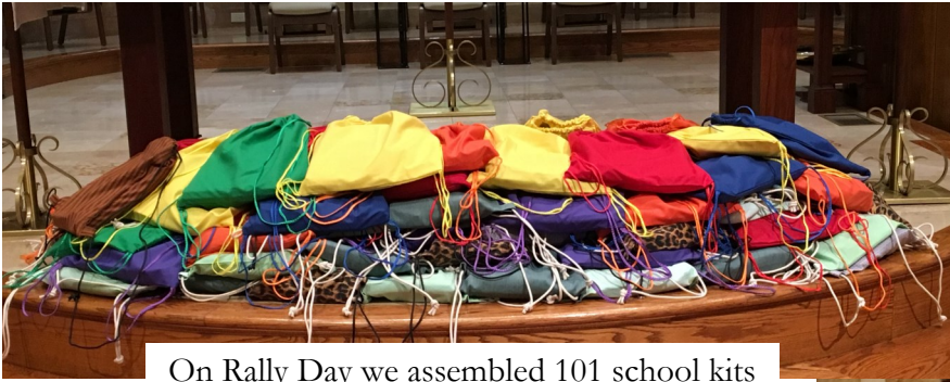
On Rally Day we assembled 101 school kits for Lutheran World Relief.

In addition, our WELCA group assembled 120 personal care kits for Lutheran World Relief.