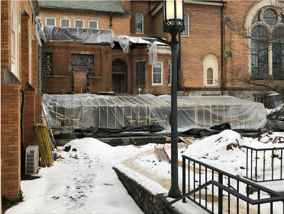
No, we aren't having a camp out! The tenting (and supplemental heat) helps maintain an appropriate temperature so the concrete floor of the lower level can cure properly.