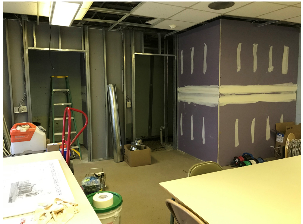
Recognize this room? It is room 16, across from the church office. The storage closets along the back were removed. On the left, you can see the framework of the new mechanical closet. On the right (purple drywall) is the outside of the new accessible restroom.