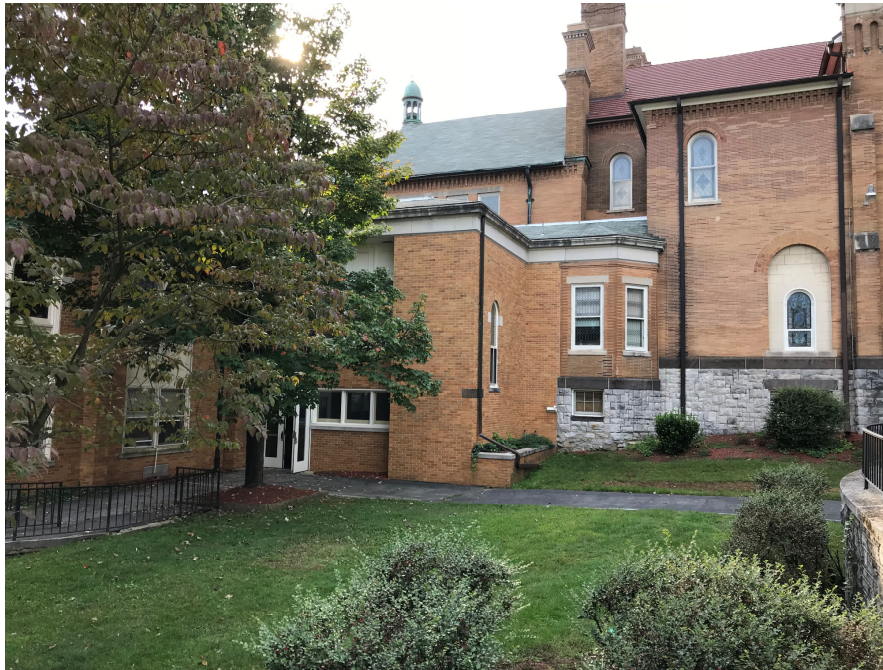
September 2018 - before!

Though we found pipes where we didn't expect them and rock where we didn't want it and experienced a very rainy fall, an early snow in November, and very frosty temperatures in recent days - we are making progress on our atrium project and interior renovations!