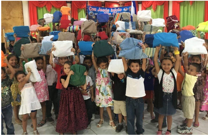
In 2016, an estimated 28,485 children received School Kits in Honduras. These kits contain essential supplies that ensure children can continue their learning despite the many challenges they face.

October is LWR Ingathering month. First Lutheran volunteers have made approximately 100 quilts for LWR, which will be displayed and blessed at worship services on Sunday, October 2, before being delivered to the LWR Warehouse in Maryland. Donations are being accepted to help offset LWR's shipping costs when distributing quilts and kits. Please give generously to help assure that LWR's work continues throughout the world. LWR envelopes will be available at worship on Sunday, October 2; checks should be made payable to "First Lutheran Church" and designated for "LWR."