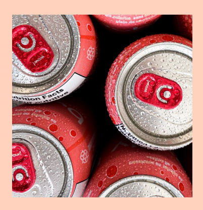
Thanks for your support!

First Lutheran continues to collect rinsed (please!) aluminum cans and pull tabs to benefit two local causes, Cumberland-Goodwill EMS (cans) and the Ronald McDonald House in Hershey (pull tabs). Labelled collection containers are in the hallway by the church office.