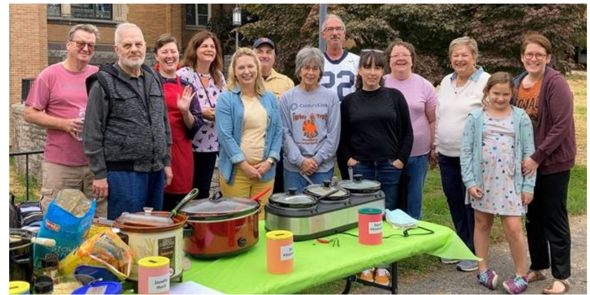
Above: Folks enjoy sampling 12 different chili recipes.