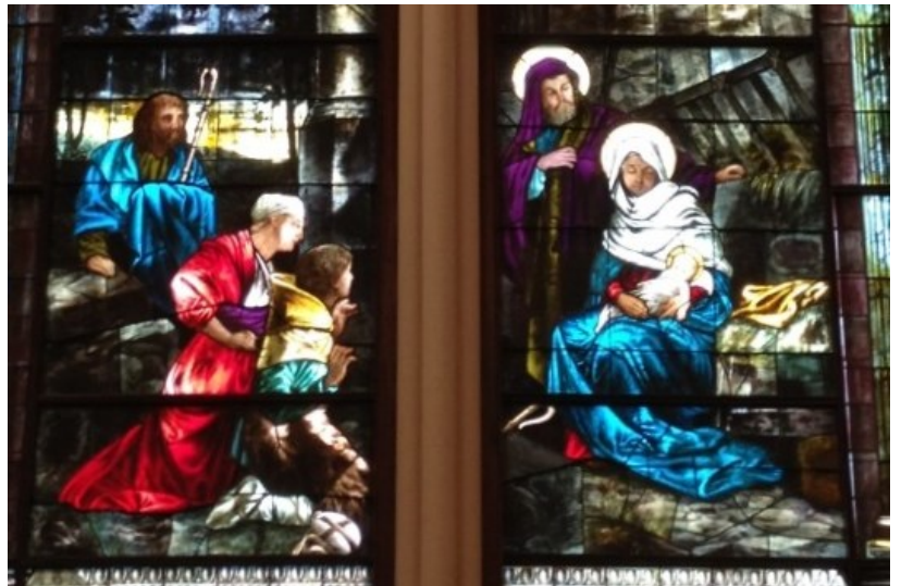
First Lutheran Nativity window

All three of our Christmas Eve services include communion and candle-lighting as we sing Silent Night together. Our 4 p.m. service is a spoken service with several Christmas carols. Our 7 p.m. service is a children and family-oriented service, with children and youth participating in worship leadership. Our 10 p.m. service is a full festival Christmas celebration, with music by our Chancel Choir.