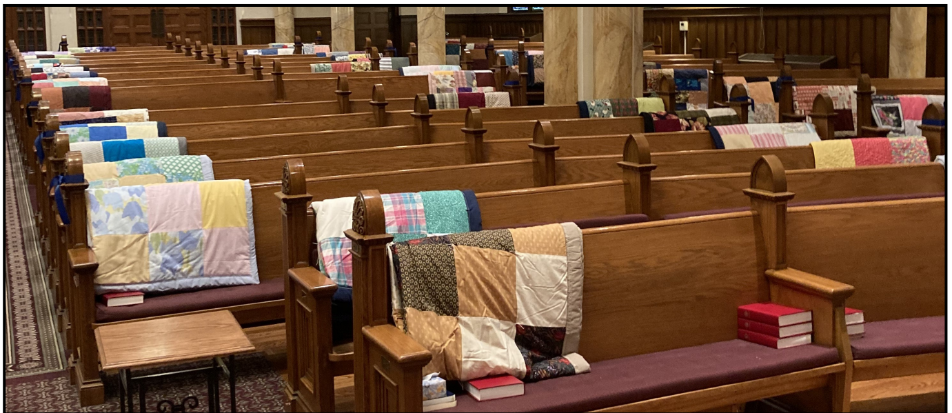
Above, some of the 94 quilts displayed and blessed on Sunday, October 2.

Lutheran World Relief (LWR) Mission Quilts create a tangible, lasting bond between the people who lovingly assemble them and our neighbors around the world who receive quilts in the greatest times of need. LWR sends an average of 300,000 quilts worldwide each year. And each year, our quilting group makes and sends approximately 100 of those quilts to LWR for distribution!