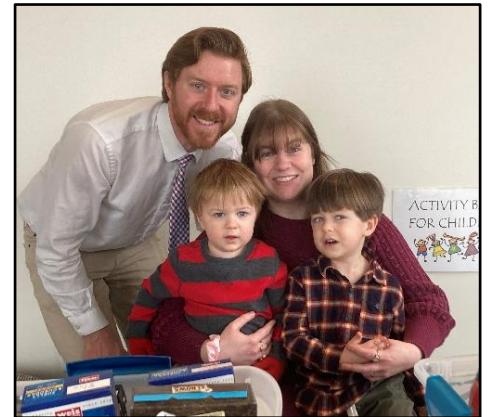
The Stuby family staffing a table during the Souper Bowl of Caring.