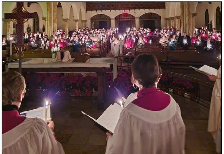
The view from the chancel during candle lighting!