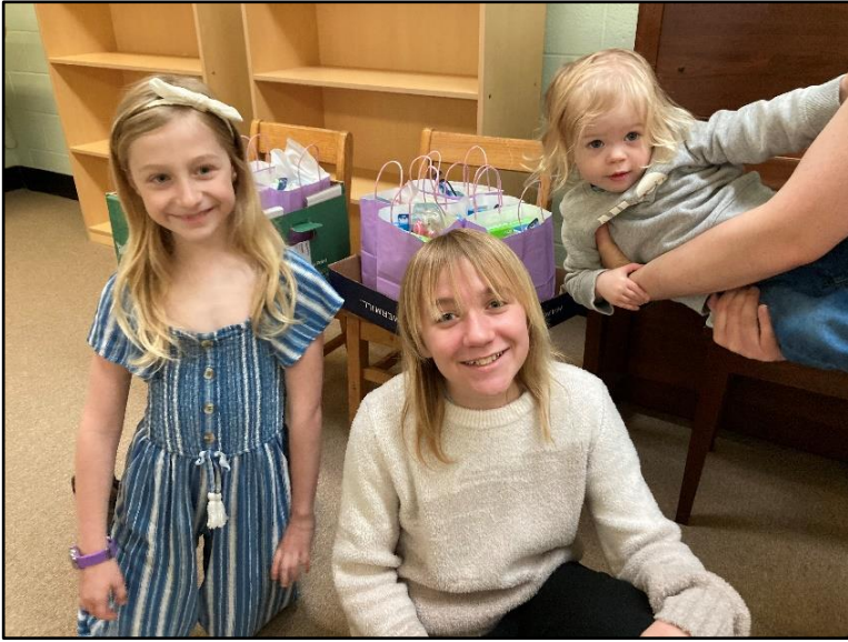
2 nd Sunday Service Projects — personal hygiene kits for Domestic Violence shelter residents