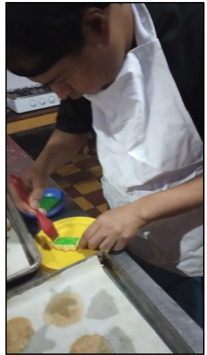
Right: a bakery worker making Christmas cookies