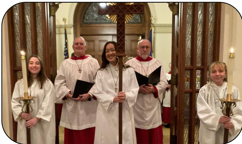
Ready to process on Christmas Eve!