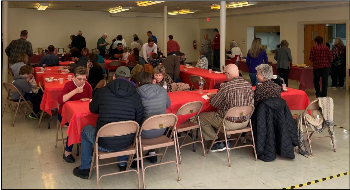
A big crowd attended this year's Chili Cook-off benefiting Project SHARE!