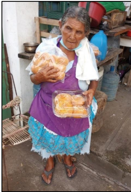
The vocational training and food ministry of our Sister Parish, Divine Redeemer, in El Salvador