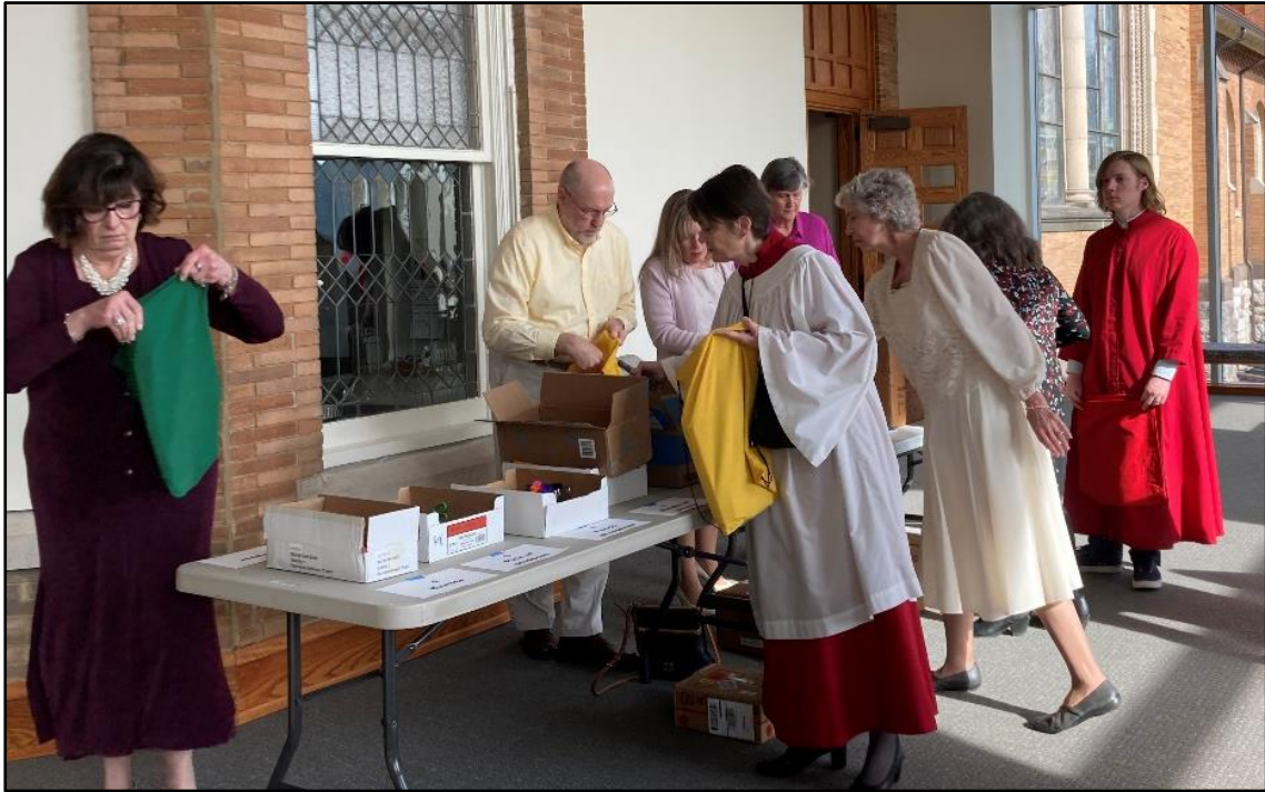
Volunteers assemble school kits for Lutheran World Relief using donations collected during Lent.