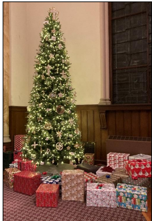
Advent Fill-A-Box packages for Carlisle Area Family Life Center and Safe Harbour.