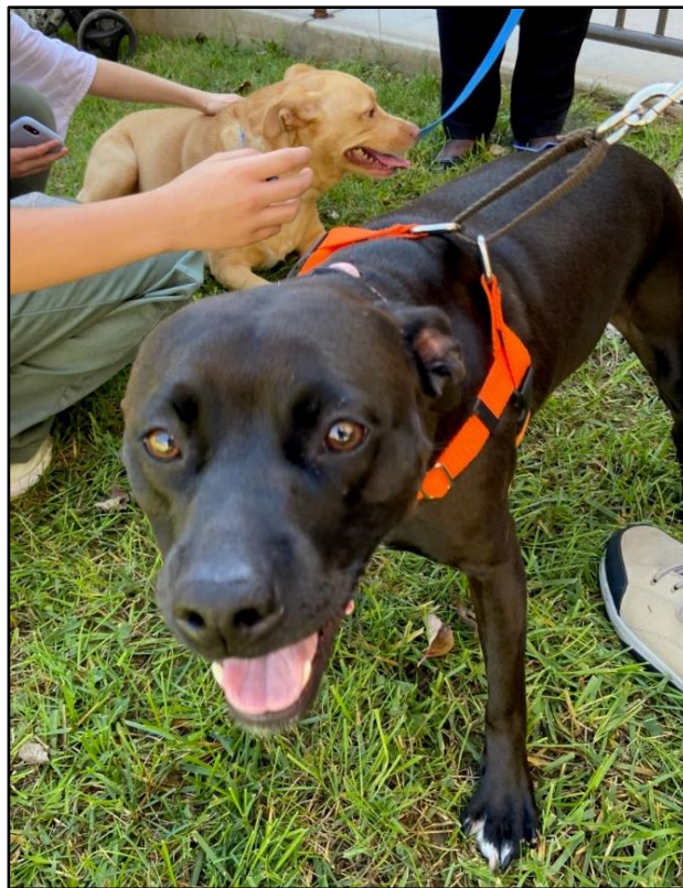
Participants in our first "blessing of the animals" on October 6 th !