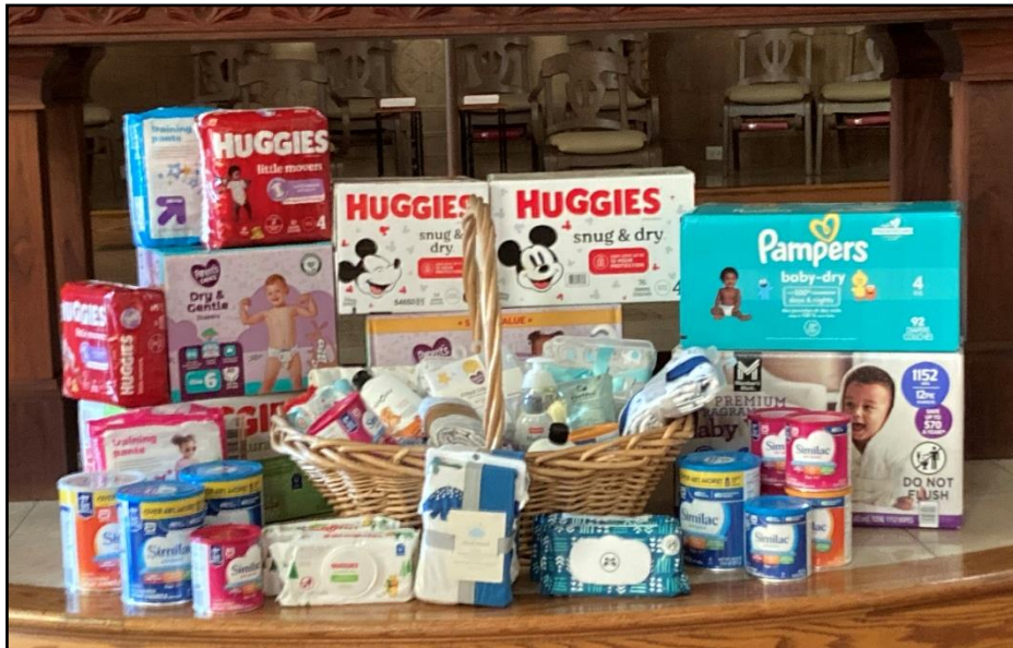
Christmas in July donations blessed during worship in August

A huge thank you to all! Our ability to help provide for those in need in our community and around the world could not happen without YOU!