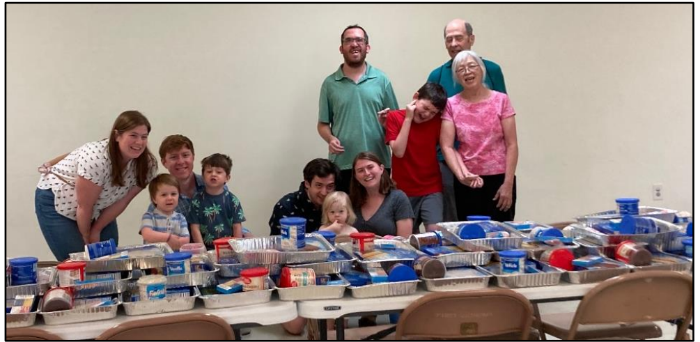
2 nd Sunday Service Projects — birthday kits for the Project SHARE food pantry