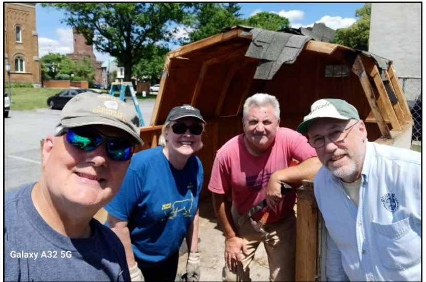
The shed wrecking crew!

The original 1901 wood doors fronting Bedford Street are currently undergoing restoration to their original condition by the same specialist who restored the High Street doors in 2016.