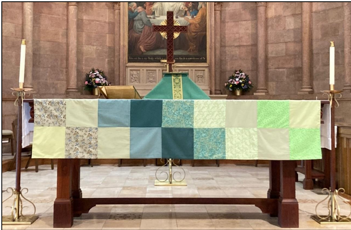
Honoring our long-standing LWR quilting ministry with new paraments (made by our quilters in 2024) for use each October.