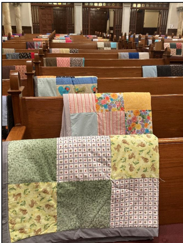
Quilts blessed in October for Lutheran World Relief